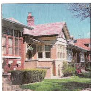
Owners of certified Chicago bungalows can take measures to improve the energy efficiency in their homes.