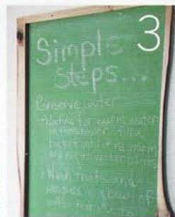
1,3,5,8: A Cooler Planet has a little bit of everything home-related. 4,6: Green Home Chicago offers furniture and artful accessories (the lamp is by Ted Harris). 2,7: Grasshopper 510 focuses on high-end accessories.